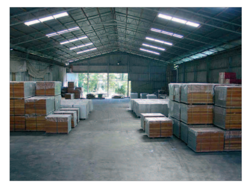
Antekad has access to extensive supplies of raw materials and thus is able to guarantee short delivery times, even for large quantities

Thanks to their quality, Antekad hardwood production pallets are supplied to